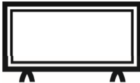
Television/ TV (2)

Join in with our Sign of the Week. Make and share your own video using the hashtag #WeTalkMakaton.